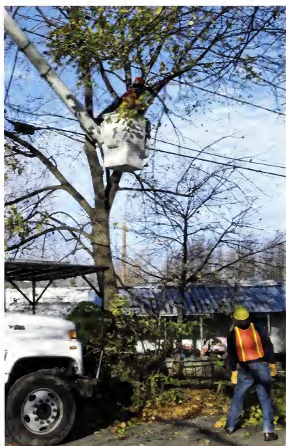
Figure 8. Companies with an active compliance agreement can access the dedicated debris removal site in Massachusetts.

Homeowners and property owners should hire companies that have compliance agreements for working on ALB host trees. Those with compliance agreements have access to the